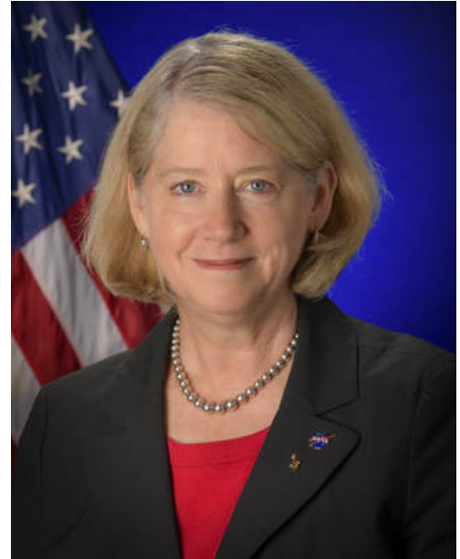
NASA Deputy Administrator Pam Melroy

I appreciate the positive energy from everyone who has engaged in this effort thus far, and NASA remains committed to transparency in our exploration plans. I look forward to future collaborations as we push human exploration farther into the solar system than ever before.